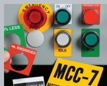
Control Panel Labeling