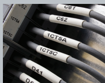
Wire & Cable Labeling