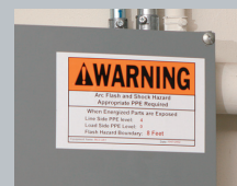
General ID ...and many more!