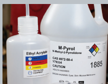
Right To Know Labels